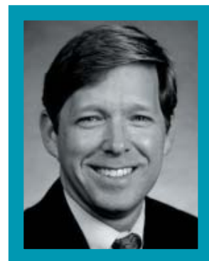
Mayor John Peyton Mayor / Chief Executive City of Jacksonville