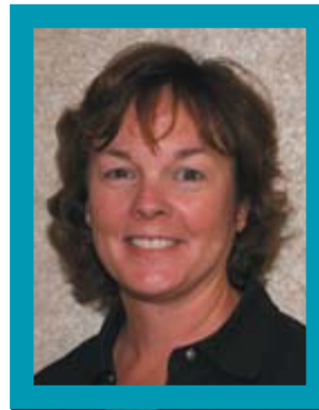
Hon. Christy Fitzgerald Clay County